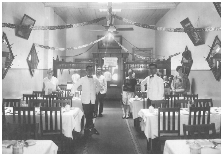
THE RITZ CAFÉ Christmas 1925 135 Barrack Street Perth WA