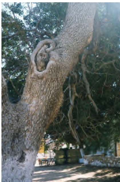
The Old Tree at the Horafia in 1992

I have photographed the tree as it stood in 1992 and again during my recent visit in September last year. I may add the stump remaining has virtually perished and possibly soon will disappear totally. Perhaps this is my recent motivation to share the story with the readers of the Megisti Messenger .