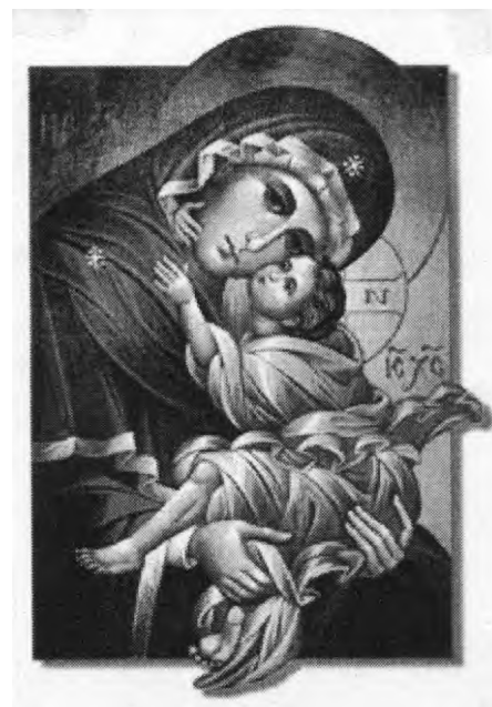
Icon of Mother and Child

I now feel confident in narrating the story for the following reasons.