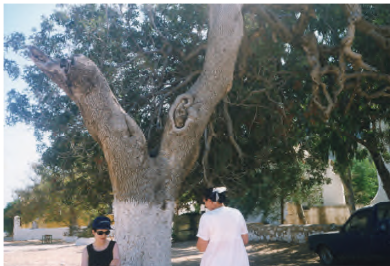
The Old Tree at the Horafia 1992

On the stump of the tree an "effigy" of the Virgin Mary holding the infant Jesus appeared and on the base of the fallen branch the "effigy" of the buried Saint. However one accepts this today, I can remember very vividly the reaction of the Castellorizians of the time. To my childhood recollection the whole island appeared to have gathered on the site where prayers were offered and a candle lit procession took place with clergy and other inhabitants.