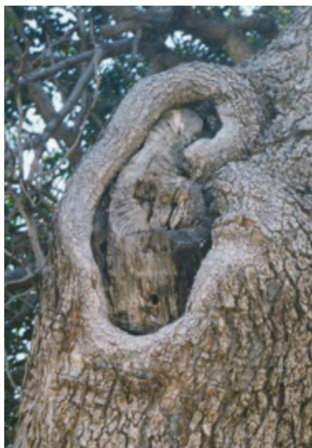
Closeup of the 'Effigy'