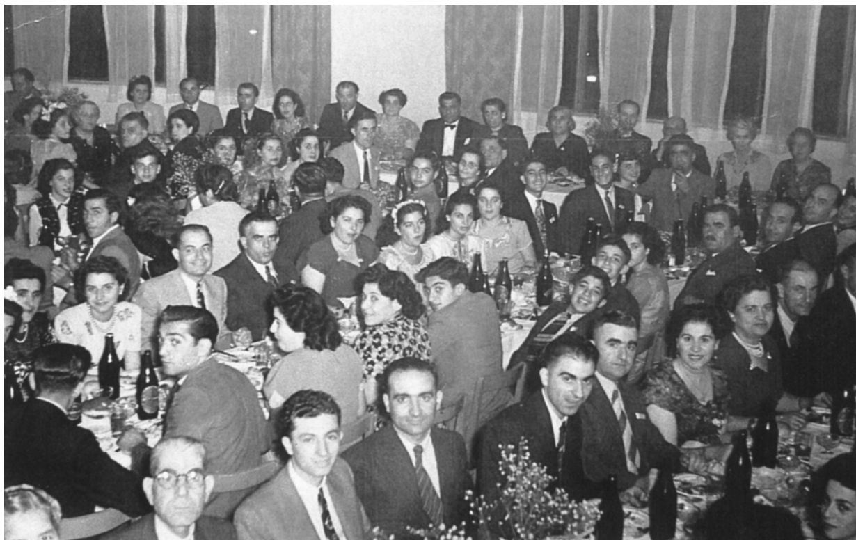
GREEK SCHOOL PERTH WA