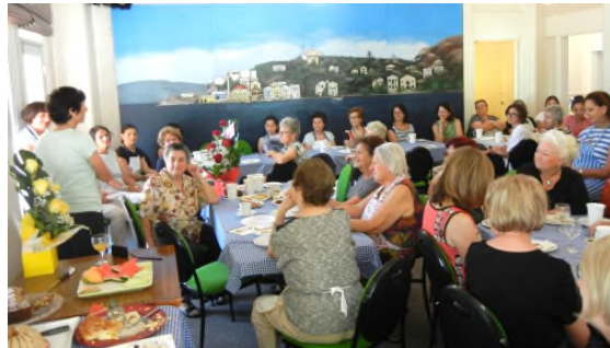
End of Year Celebration