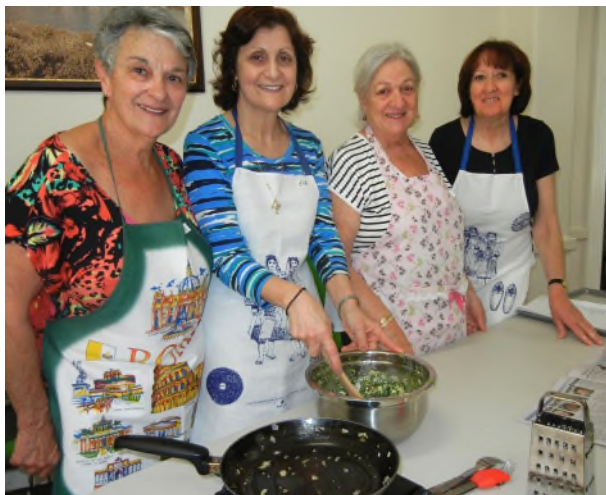
Spinach and Feta Roll Class