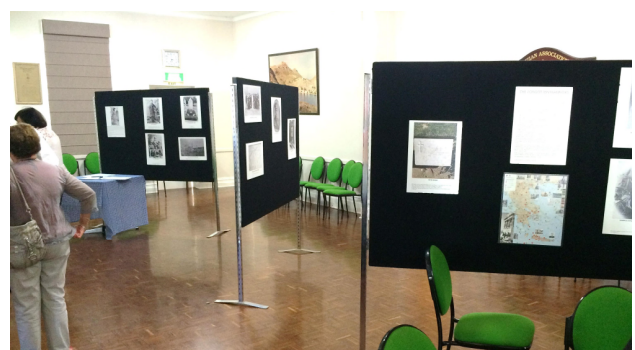
The Exhibition at Castellorizian House