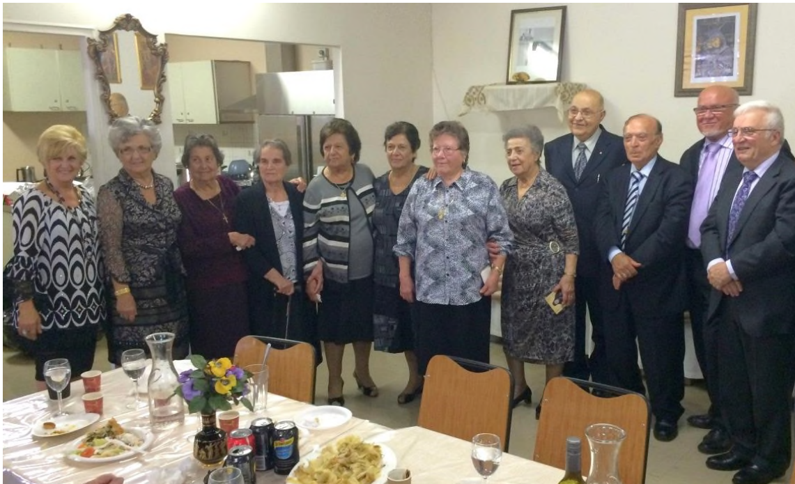
Western Australian Castellorizian Survivors at the 70 th Commemoration