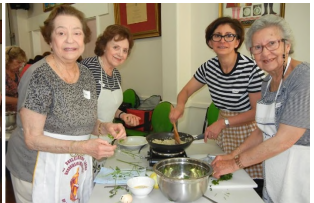
Spinach and Feta Roll Class

ADDITIONAL SPINACH AND FETTA ROLL CLASS PHOTOS ON NEXT PAGE