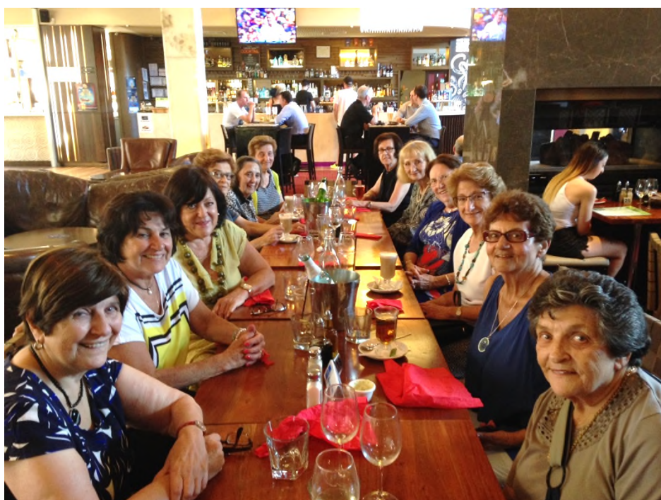
The Hellenes Bridge Club celebrating at their 2015 Christmas Lunch

The Bridge Club has been going for approx. 20 years at Castellorizian House