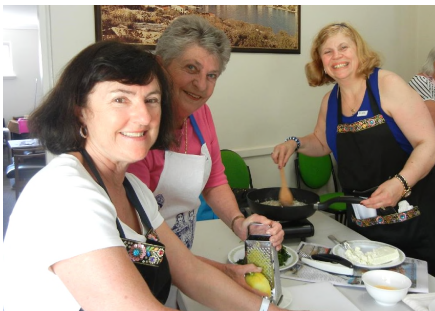
Spinach and Feta Roll Class