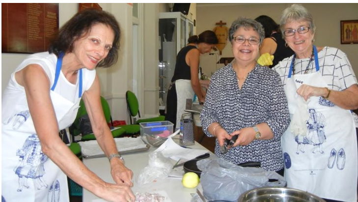
Spinach and Feta Roll Class

Καλά Χριστούγεννα και ευτυχισμένο το νέο έτος