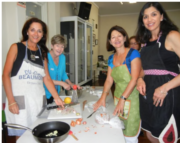
Spinach and Feta Roll Class