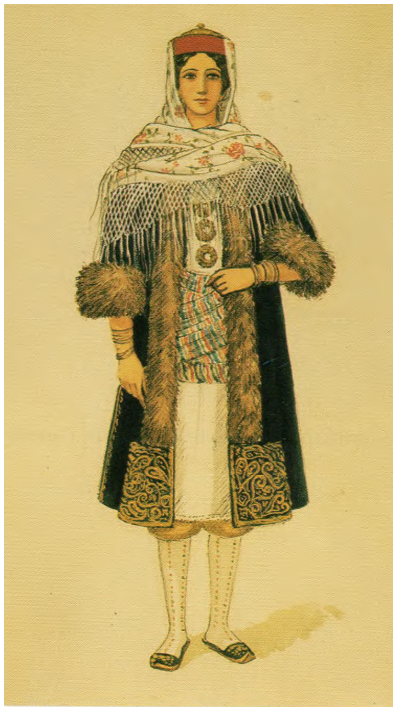
Γυναίκεία φορεσιά νύφης Καστελλόριζου. Woman's Castellorizian dress bride's.

The Castellorizian Brides Exhibition will be officially opened at 2.00pm on Sunday 5 th November 2017.