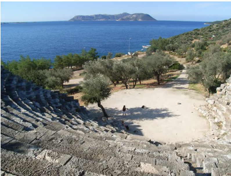
THE HELLENISTIC THEATRE AT KAS (modern day Antifilo or Antiphellus) with Castellorizo island in the background.