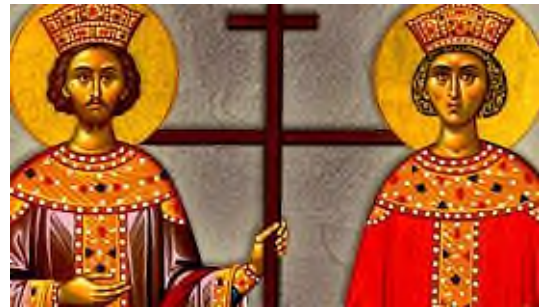
Feast Day of Saints Constantine and Helene on Friday May 21 st 2010 Luncheon to be held at Perth on Sunday May 23 rd 2010

In two weeks time removal of the remaining front fence and the erection of a new fence should commence. There may be some minor inconvenience for front door access during this time.